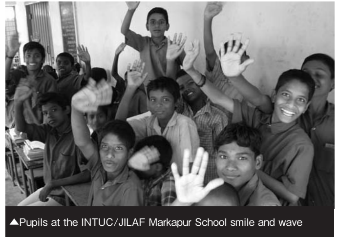
▲Pupils at the INTUC/JILAF Markapur School smile and wave

Ongoing solidarity with local society will surely be an indispensable element in the activities of current and future projects.