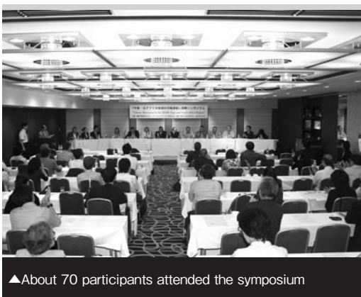
▲About 70 participants attended the symposium

The holding of this symposium confirmed that everyone had a common thought and feeling about the realization of peace in the Middle East. All the participants strengthened their perception that trade unions shared support peaceful coexistence between Israel and the Arab states and should strengthen international solidarity towards the realization of peace.