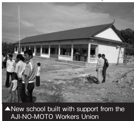
▲New school built with support from the AJI-NO-MOTO Workers Union

The AJI-NO-MOTO Workers Union is scheduled this year, working with the NPO ASAC (Association of School Aid in Cambodia), to construct its tenth school building, which will be in the of Kampot Province in southern Cambodia. The Union has constructed one school building each year since 1998 as part of its social contribution to provide educational opportunities for children. Union members visit Cambodia on such occasions as the opening ceremonies for the schools, and present the