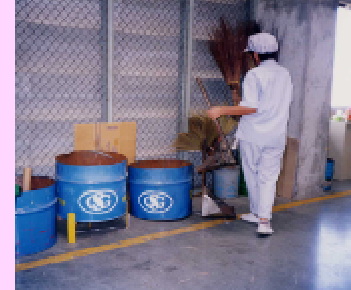
(6) Environmental protection

Each technical area has 6-10 simple checkpoints. Emphasis is placed on simple solutions that can improve both working conditions and productivity. For example, better materials handling using mobile racks and carts can lead to quicker transport and better product quality. Appropriate work height can facilitate safer, smooth production. Similarly, the checklists used in various ergonomic interventions in Asian countries within our networking cover all these major areas.