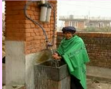
(5) Welfare facilities