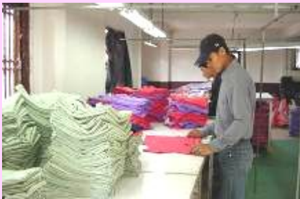
(4) Physical environment