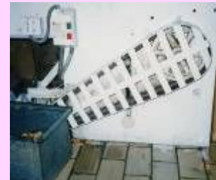
(3) Machine safety