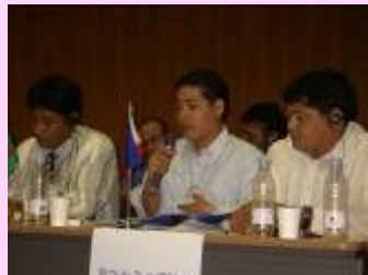
(International workshops for POSITIVE trainers, 2004 Tokyo)