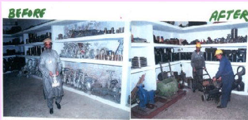
(1) Materials handling

The POSITIVE training programme covers six technical areas: