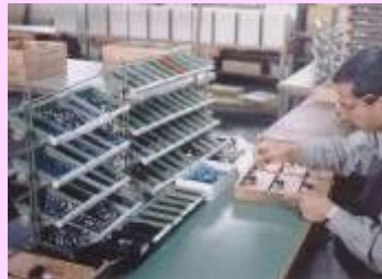
(2) Workstation changes