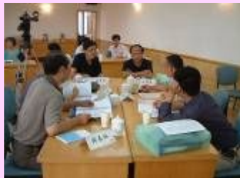
(ACFTU-JILAF project supported by JICA grass-roots funds, China)